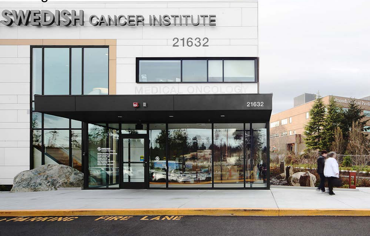
Swedish Cancer Institute and Ballard Radiation Treatment

We can optimize prefab without compromising design intent. Prefab helps reduce uncertainty in design.