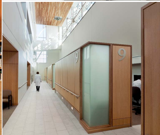
The Ottawa Hospital Regional Cancer Centre