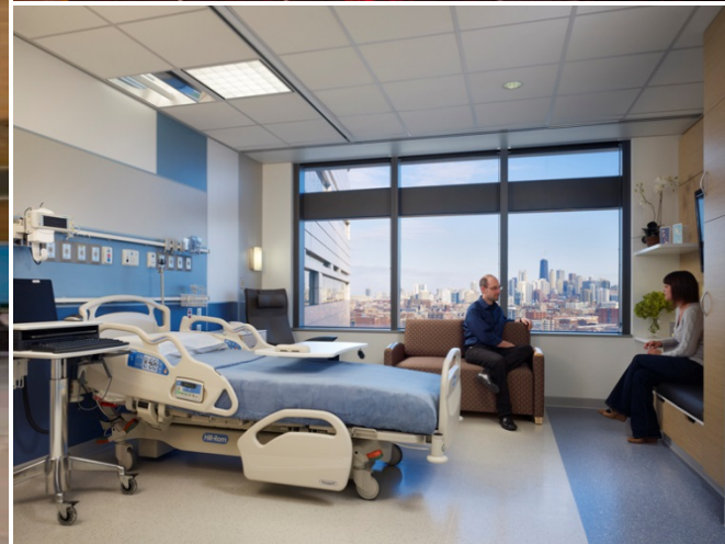
RUSH UNIVERSITY MEDICAL CENTRE, CAMPUS TRANSFORMATION PROJECT, CHICAGO